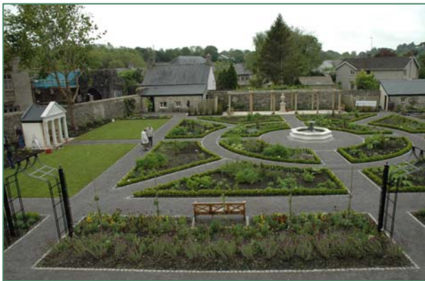
The garden in Nov. 2007.

B y May 2006 the hard landscaping of the garden was in place but there was not a desirable plant to be seen and the task that lay ahead was a very daunting one. The garden needed volunteers to dig, weed and plant the garden as well as people who could plan and organise a range of activities.