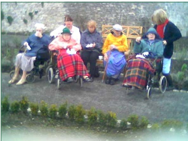
Even the rain does not deter visitors!

With the better weather the volunteers and I are looking forward to working with any new helpers, but its not all hard graft! During the summer months we need people to take tours around the garden; informal training is provided. Don't forget when the clocks change the garden will be open till 6pm. Come and see me in the garden every Thursday, or phone 07870858079 or e-mail jacky.thorne@ntlworld.com